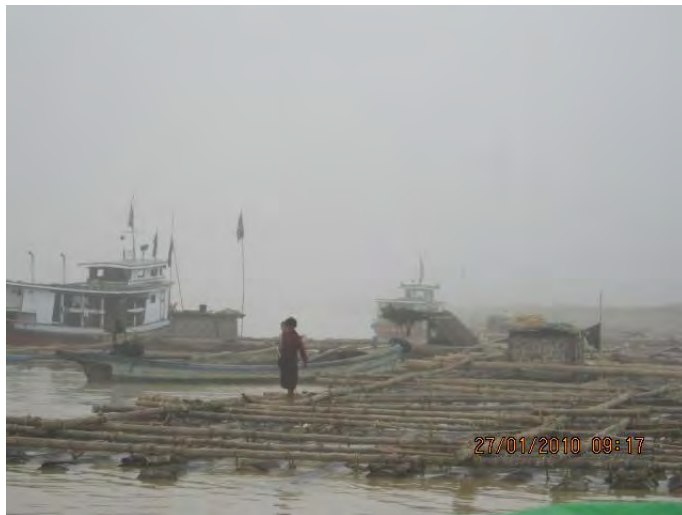
Logs are sending to China by Chindwin River.