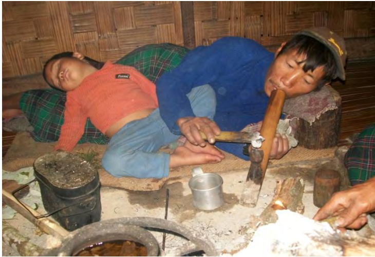
Opium addicted father do not take care of his son.