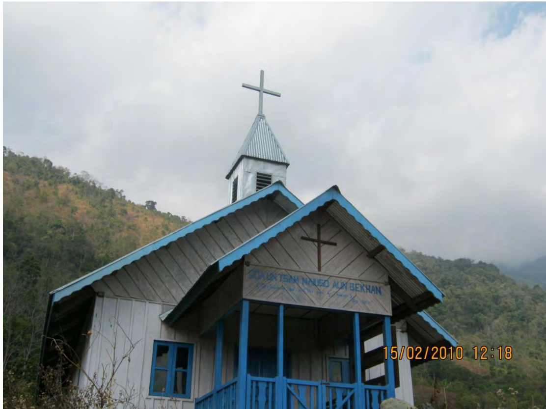
A Christian Church in the village.

The Naga were animists until American Baptist missionaries brought Christianity to the Naga people in Western Nagaland (India) in 1872 and then to Eastern Nagaland (Burma) seventy years later after World War Two in 1946. Now a majority of the Eastern Naga people are Christians.