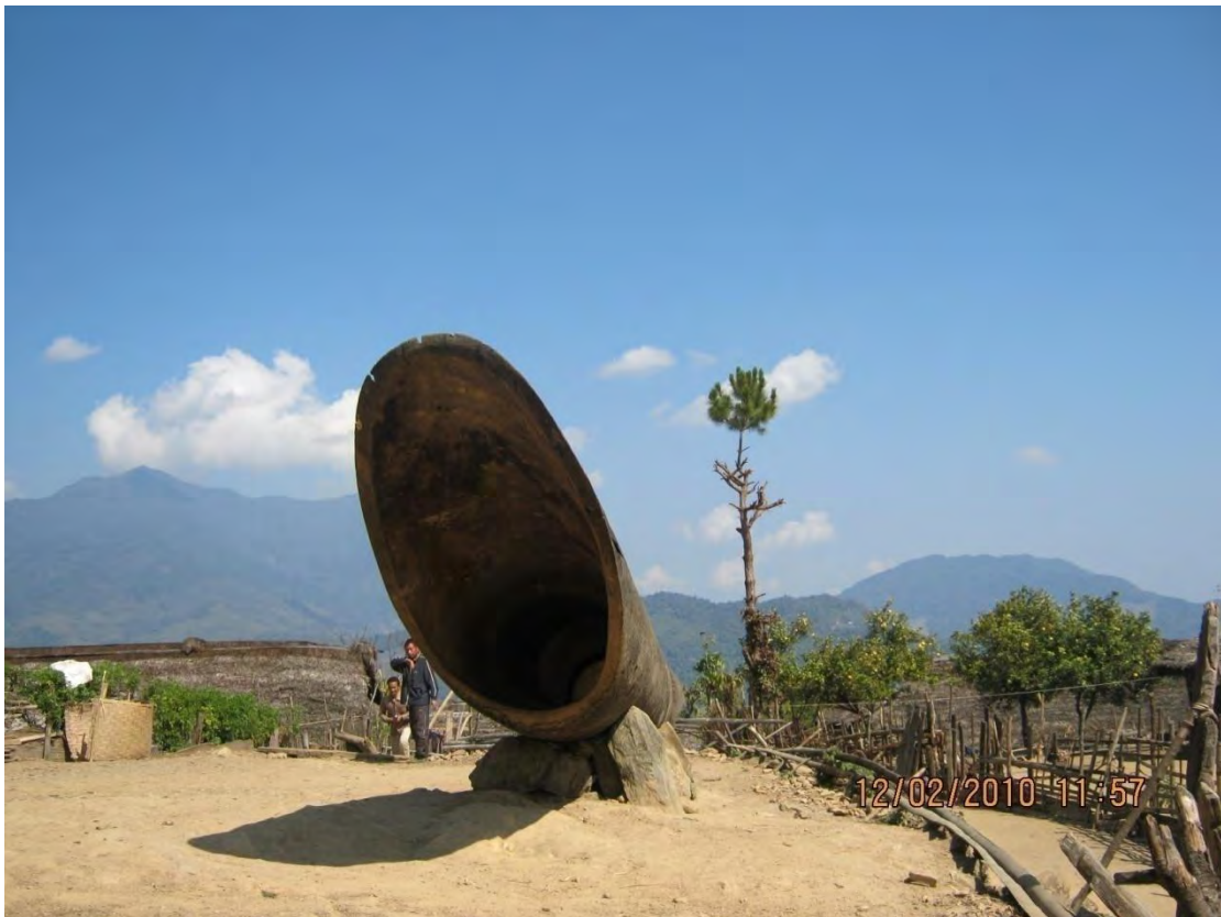
Naga log drum.