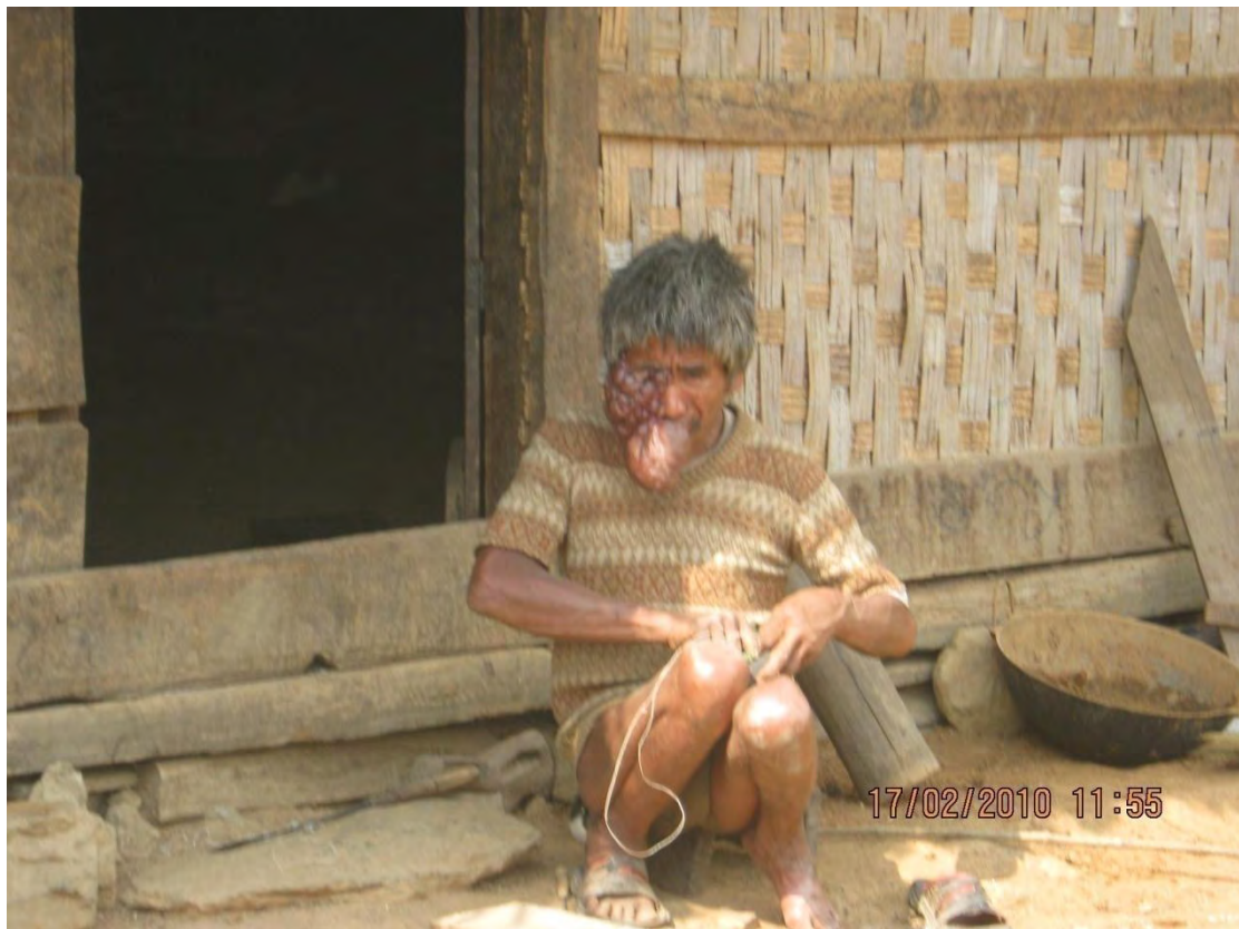
A villager is suffering from curable disease.

Today, the Eastern Nagas are living in extremely vulnerable circumstances with the constant threat of contracting dreaded diseases, such as AIDS from Burmese soldiers and workers at the jade and gold mines in Eastern Nagaland. Many villagers are dying from treatable diseases and conditions due to the lack of access to medical treatment, clean water, proper sanitation, good nutrition, maternal and child care, and health education. The only dispensaries and hospitals are found at the headquarters of the Burmese military in Eastern Nagaland and not in the villages where they are needed the most. There is also a lack of medicine in Eastern Nagaland, and any medicine, that is available, is sold at exorbitant prices to the Eastern Naga people.