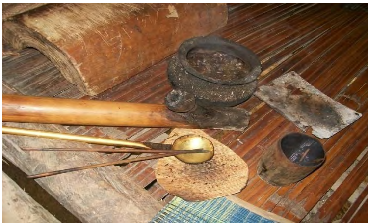
Opium smoking pipe and coking materials.