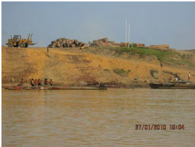
Logs are brought down to Chindwin River.

There has been no protection of the environment in the lands of the Eastern Naga people. Development has caused the loss of forests and the animals that lived in the forests. The lakes and rivers are polluted from mining and other developmental activities. The Burmese government does not take care of the natural heritage of Eastern Nagaland or consider the welfare of the future people of Eastern Nagaland; they only care about making money through their business interests and sold out the virgin forest of Naga hills to Chinese log merchants.