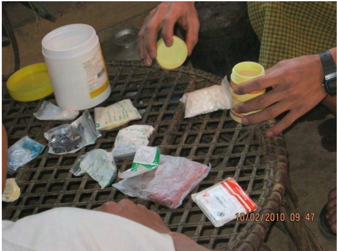
The medical team of ENDO is providing medicines to the villagers.